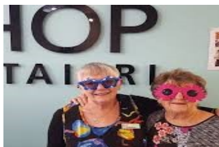
Shop 'n Taieri